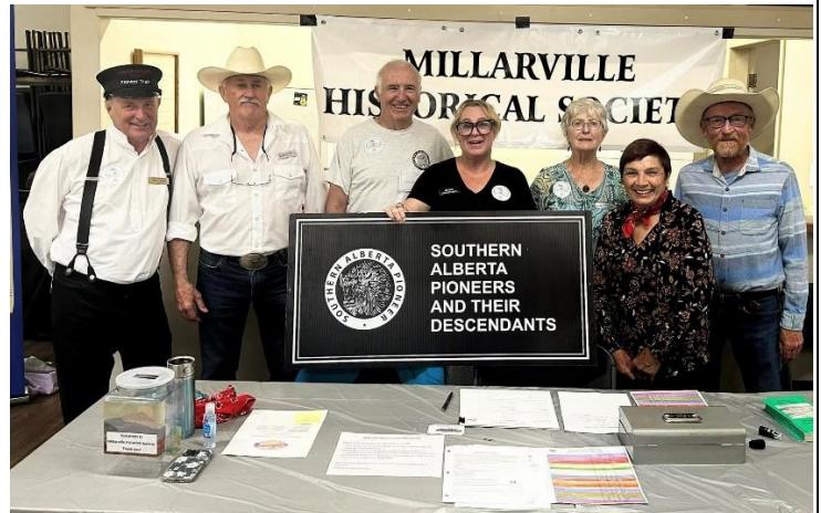
Southern Alberta Pioneers & Descendant representatives and Millarville Historical Society Board members sharing history with almost 2000 guests in the two-day fair.