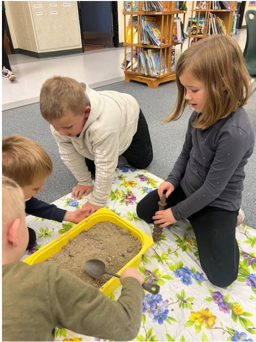
Students collaborating as they search for artifacts in a simulated archaeological dig.