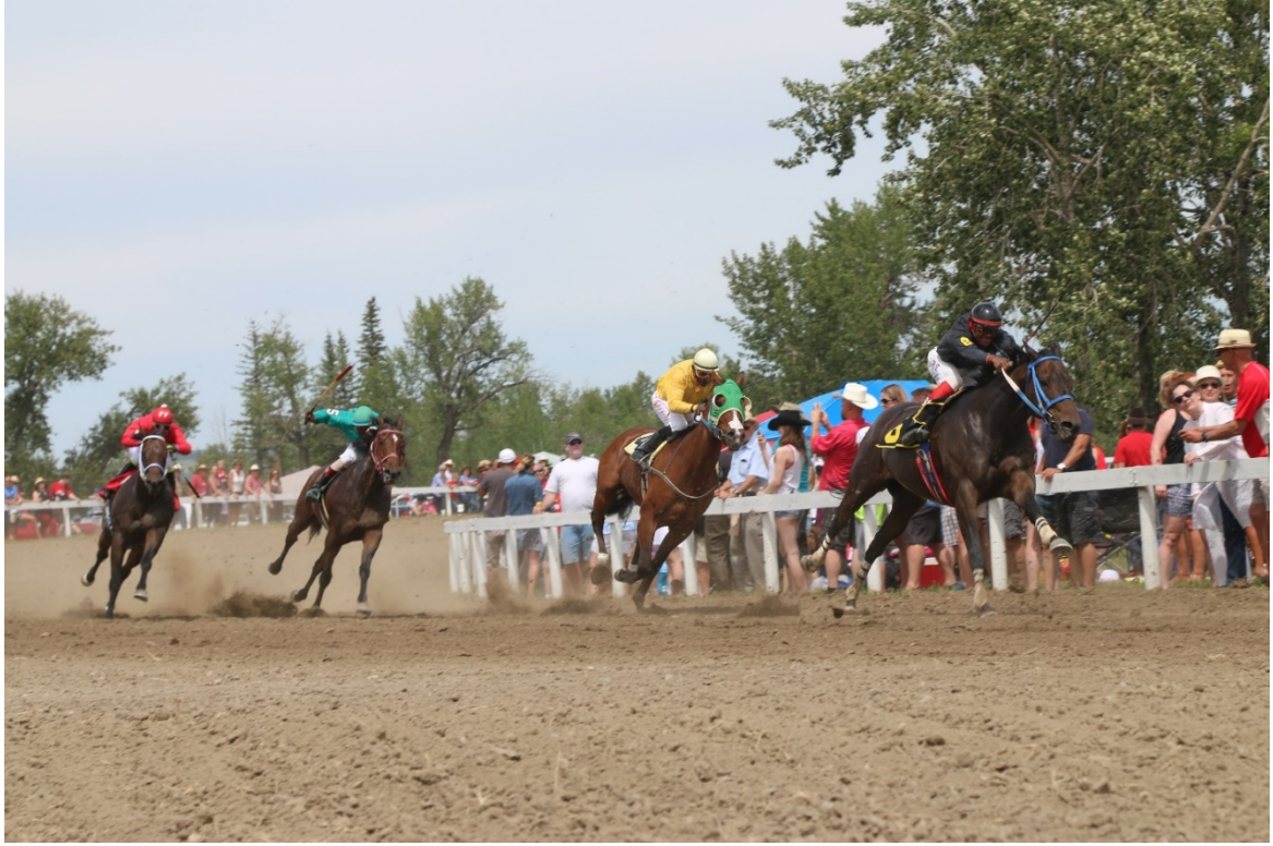
Millarville Races, 1912

July 1<sup>st</sup> this popular event features Thoroughbred Horse Racing w/ Pari-Mutuel Betting, Stock Horse Race, Ladies Side Saddle Race, Pack Horse Race, Beer